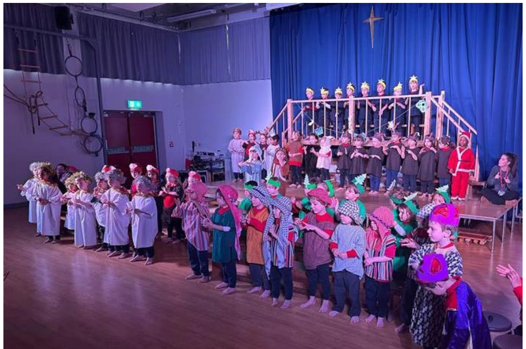
EYFS have been busy preparing their Nativity play which they enjoyed sharing with the school on Thursday before performing to a packed hall of proud parents on Friday.