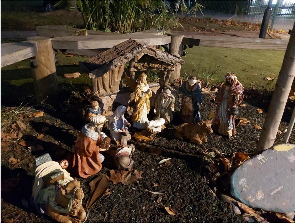
Our prayer ambassadors have set up our Nativity Scene under the Olive tree in our reflection area for everyone to share.