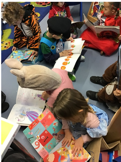
World Book Day