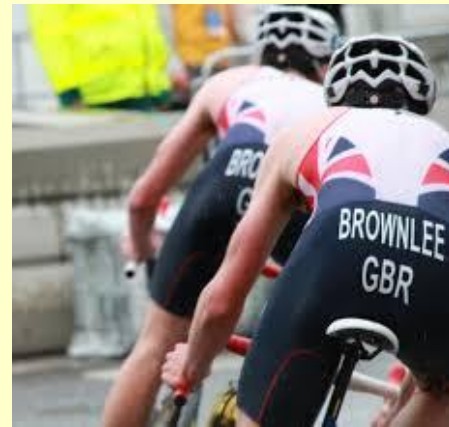
The Brownlee Brothers-Triathletes