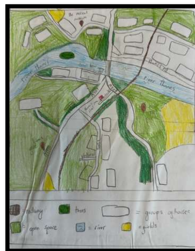
2 examples of our sketch maps by Lucas and Thomas