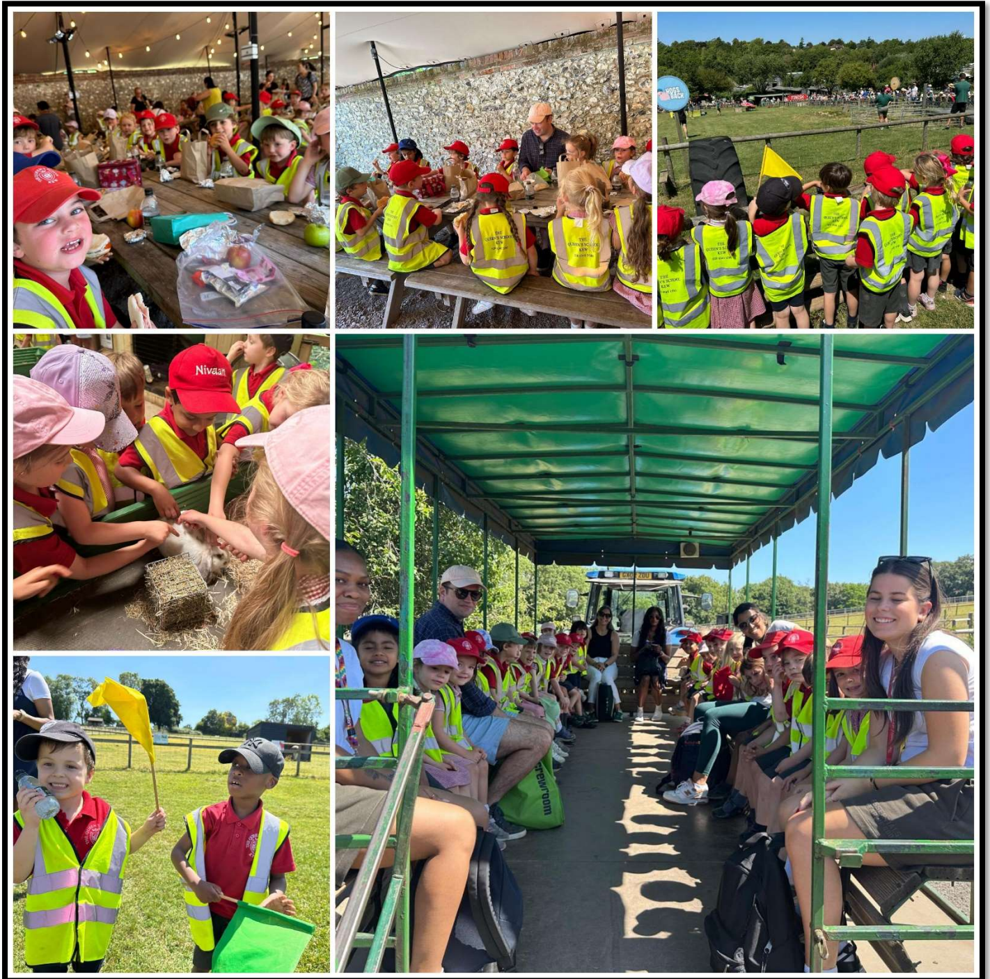
Holly Class at the Farm