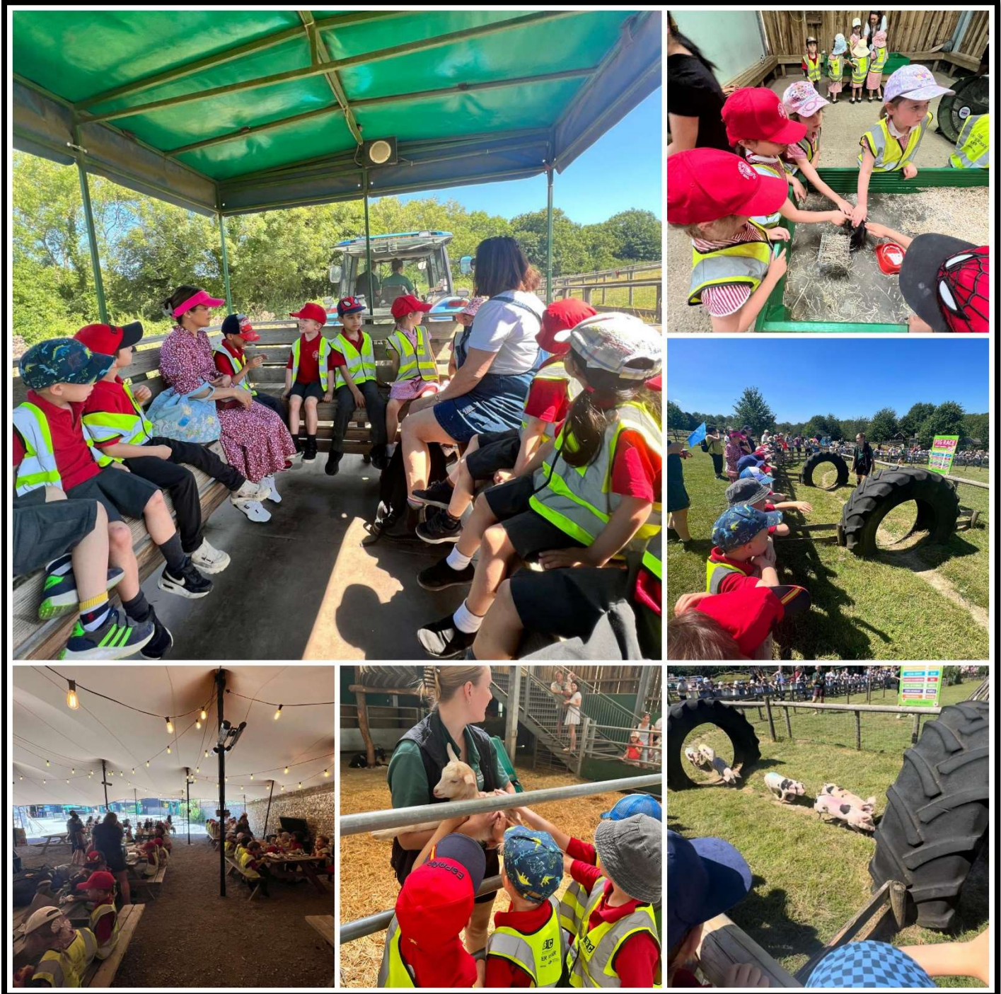
Willow Class at the Farm