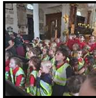
Ascending bubbles being watched by young and old!