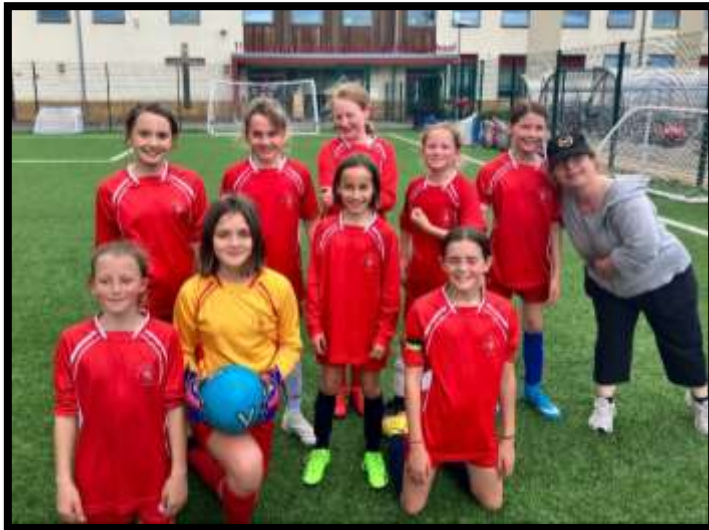
The Girls football team were proud to get to the semi-finals of the Richmond Borough Football League.

Well played everyone throughout the season, a great result!