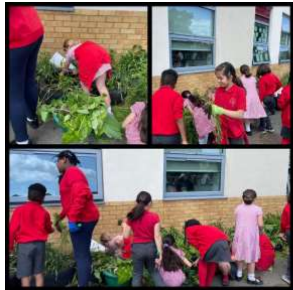
Some keen volunteers helping prepare the tyres for some summer planting.