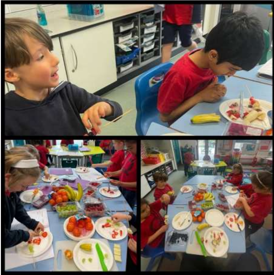
Year 1 designed and made their own fruit kebab as part of their Healthy Eating topic in Science. Delicious and lots of fun.

We are also learning about direction and position in Maths and we had to follow instructions and mark a big X to show where we ended up!