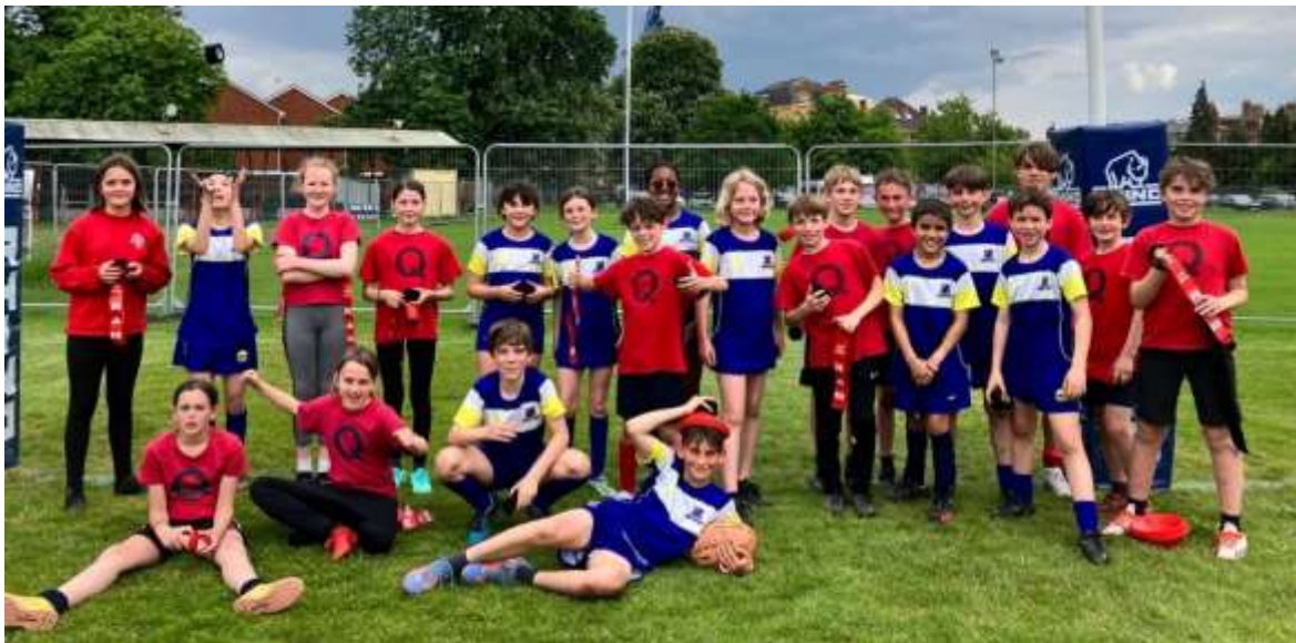
The Tag Ruby team - winners of the Kew Cup

Well played everyone throughout the season, a great result!