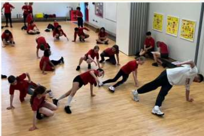
Year 6 Urban Strides Street Dance workshop