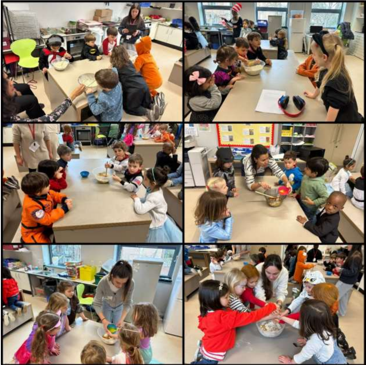
Run, run as fast as you can, Reception are baking Gingerbread men!