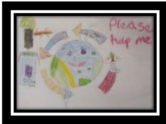
Chloe and Taya in Maple Class